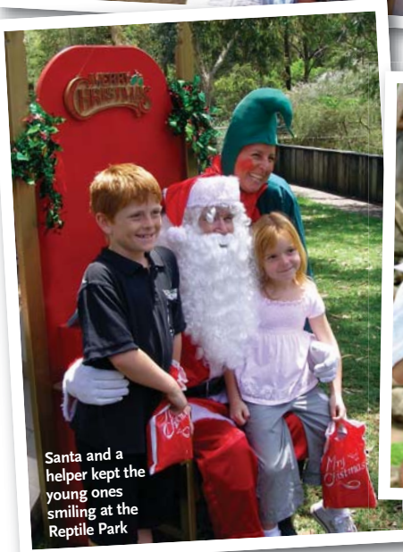
Santa and a helper kept the young ones smiling at the Reptile Park