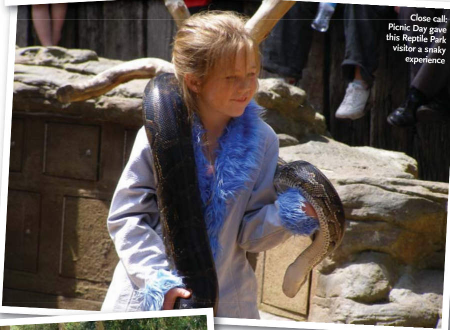
Close call: Picnic Day gave this Reptile Park visitor a snaky experience

MEMBERS took full advantage of the extra choices on offer for the December Union Picnic. Novocastrians flocked to the Australian Reptile Park, near Gosford, which put on a rapturous reptilian show that had young and old gobsmacked. The Western Plains Zoo at Dubbo was another new venue that aimed to please.