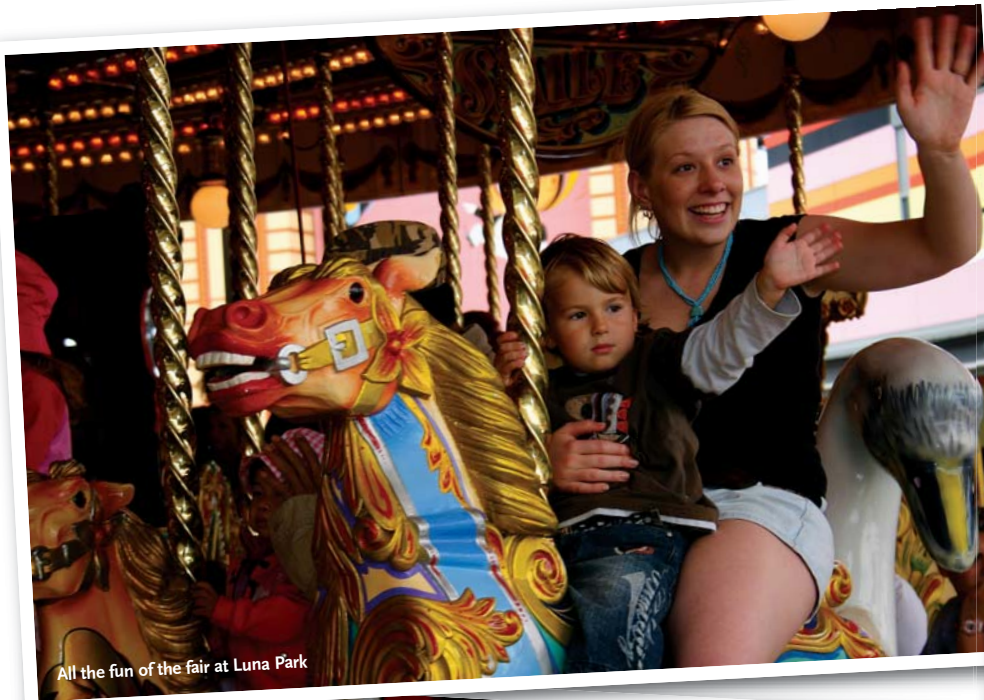
All the fun of the fair at Luna Park