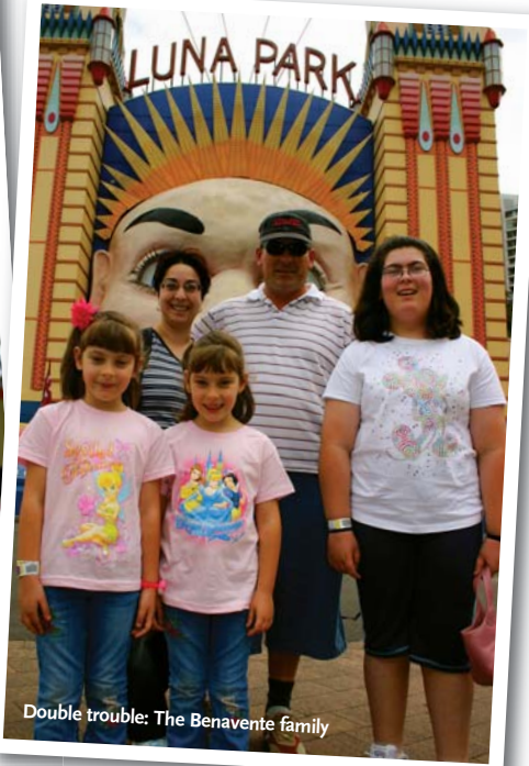
Double trouble: The Benavente family